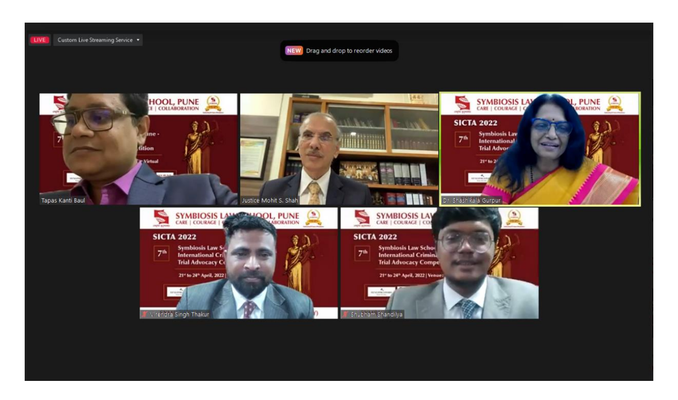
Panel for the Inaugural Session