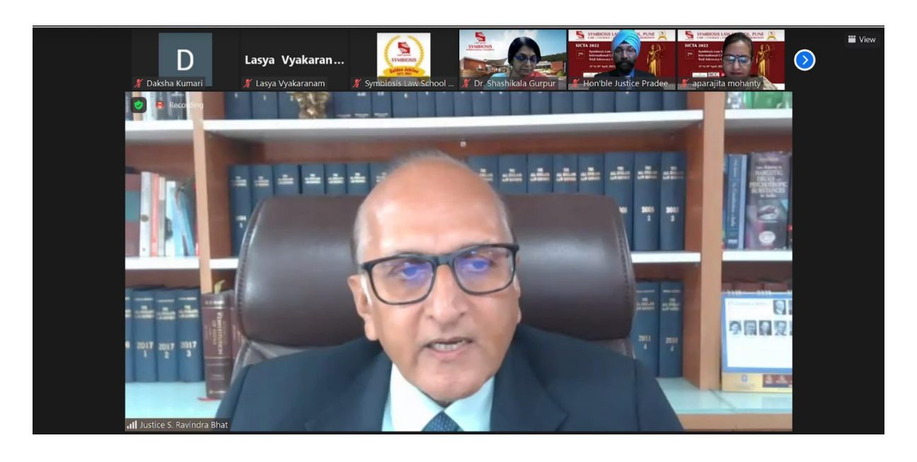
Chief Guest, Hon'ble Justice Ravindra Bhatt, Judge, Supreme Court of India addressing the audience