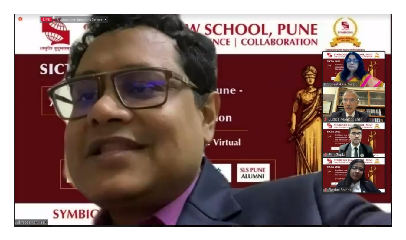
Guest of Honour Tapas Kanti Baul, Prosecutor, International Crimes Tribunal, Bangladesh