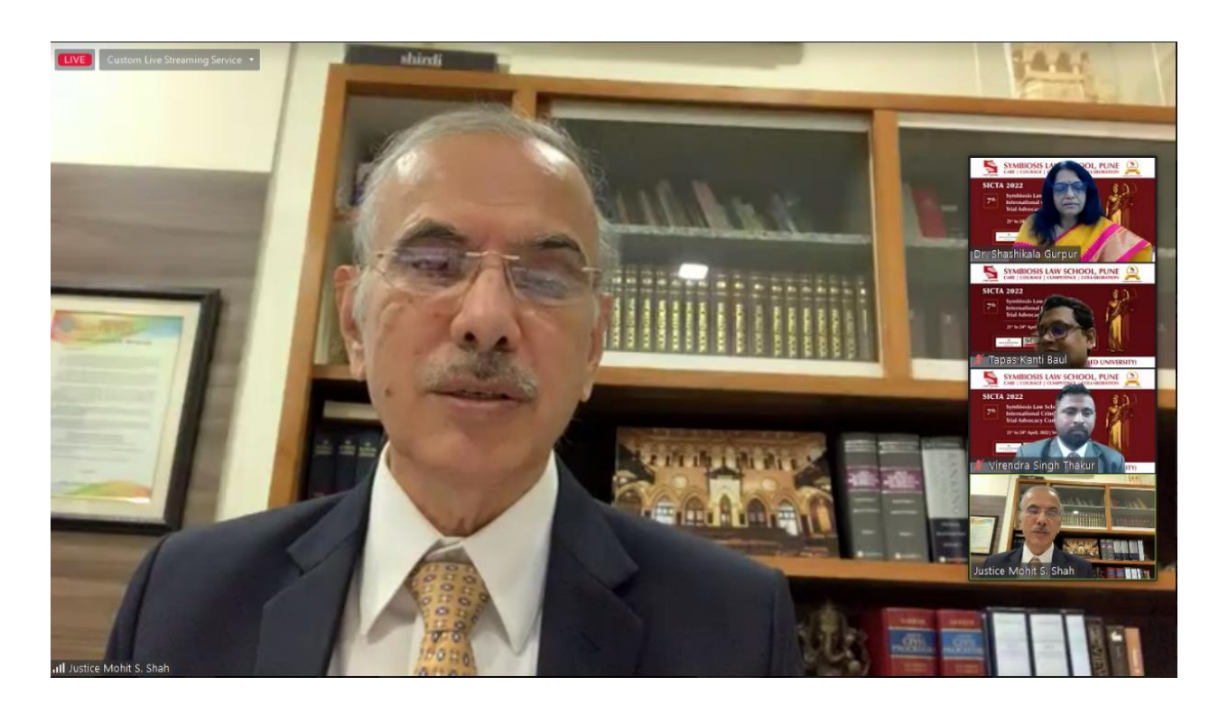
Chief Guest Hon'ble Justice Mohit Shah, Former Chief Justice, Bombay High Court